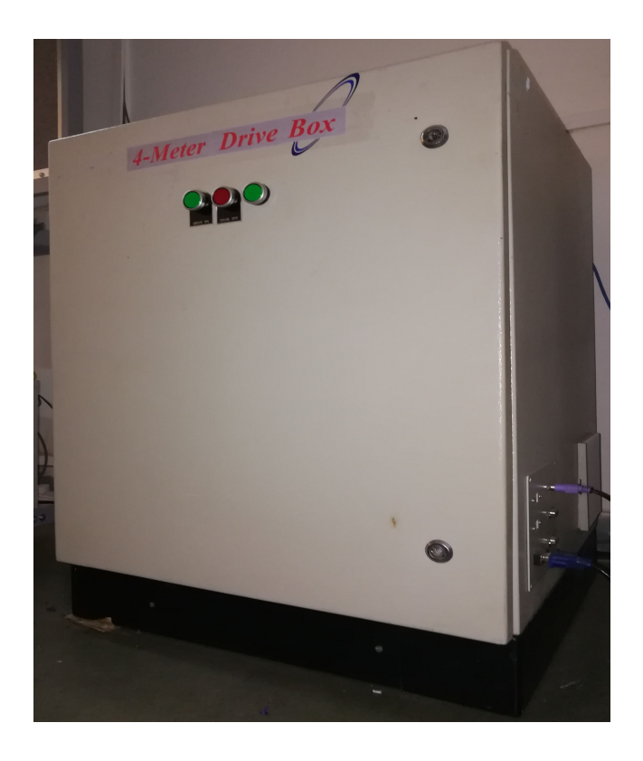
Figure 2: 4m Drive box

Press green buttons on 4m drive box, which start stepper motor driver and encoder PC 104.