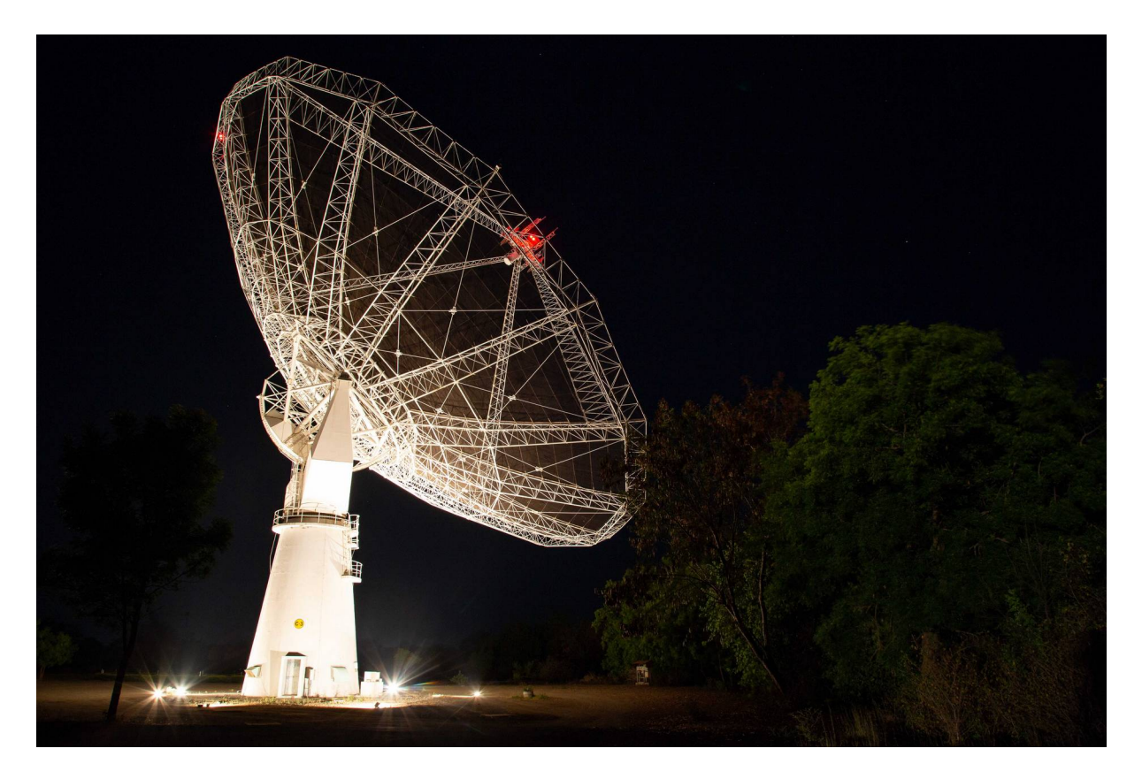
Caption: A GMRT antenna at night.